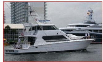
82' Hatteras 1992