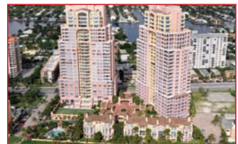
The Palms Oceanfront Villa Four story, 3Bed/4 Baths