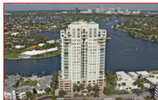
Harbourage Place Condo 3Bed3.5 Baths, 3500 sq. ft.