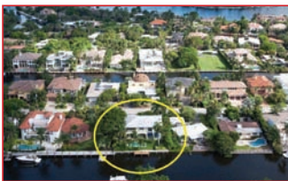
Las Olas - 4Bed/3Baths, 75' of Waterfront