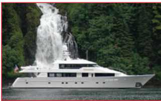
130 Westport 2007

If any of these items are on your holiday gift list, please give us a call & we will make it happen! 🌿