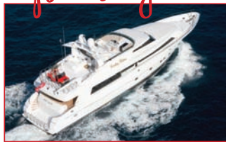
115 Northcoast 1999