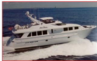
84' Hatteras 1998