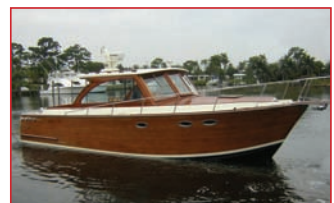
36' Windsor Craft 2006