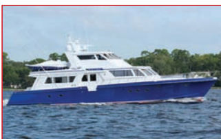
81' Huckins, 1987