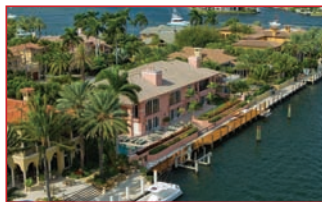
Harbor Beach - 7Bed/7.5 Baths, 150' of Waterfront