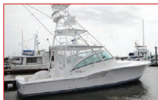
41' Albemarle 2008